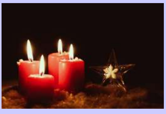
Candlelit Service of Advent Lessons & Carols